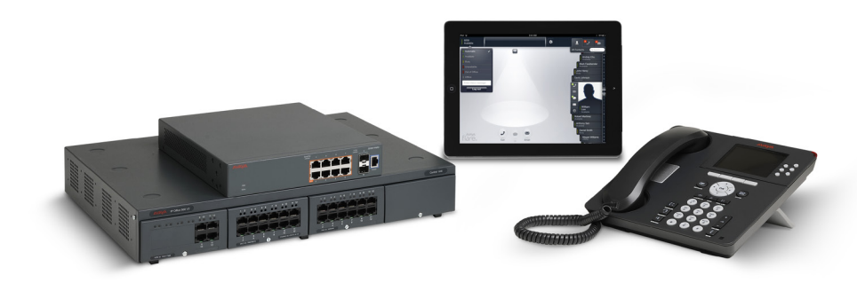
Figure 2: ERS 3500 with IP Office, the Avaya Flare® Communicator for iPad Device and an Avaya 9600 handset

For deployment scenarios where there may not be a data networking support specialist on site, the ERS 3500 provides an automated script to enable fast, error free installation when deployed with IP Office. This installation script called "run ip office"