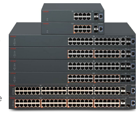
Figure 1: The ERS 3500 product family

A cost-effective, feature-rich solution, the ERS 3500 Series provides both standalone and stackable Ethernet switching perfectly suited to the unique requirements of Mid-Market and SME customers, as well as enterprise branch offices.